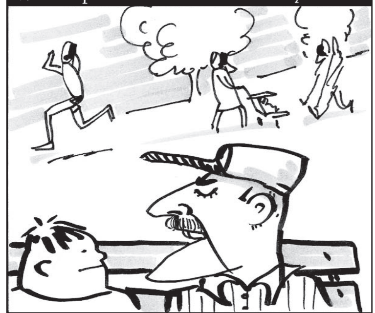
“When I was your age, a city park wasn’t a public phone booth!”