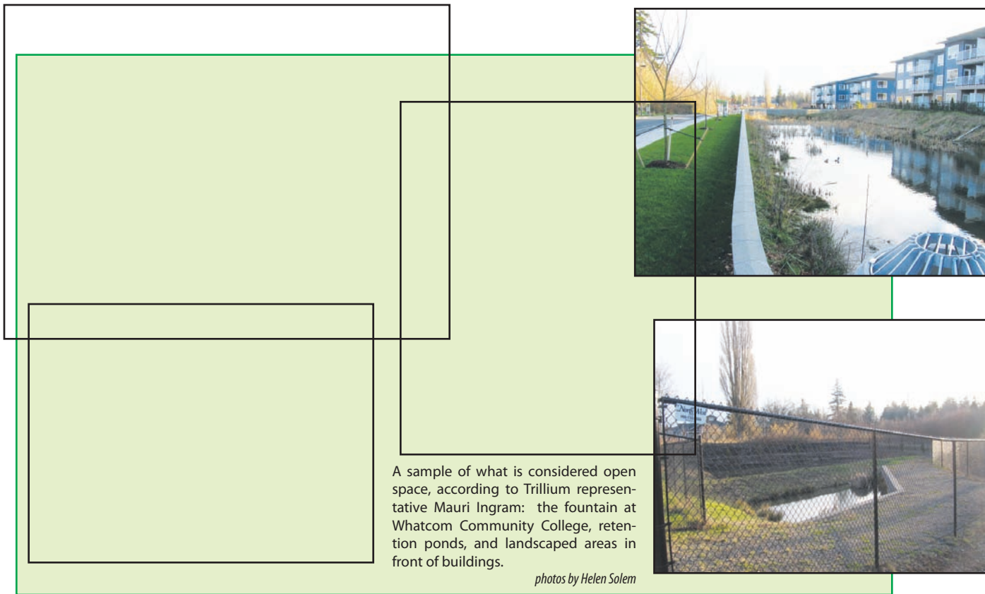
A sample of what is considered open space, according to Trillium representative Mauri Ingram: the fountain at Whatcom Community College, retention ponds, and landscaped areas in front of buildings.